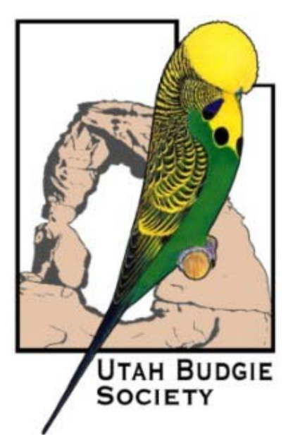
A.B.S. & B.A.A sanctioned (a one day show)

Washington County Museum 25 East Telegraph & Main Washington, Utah